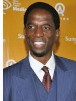
Guest Speaker A.C. Green, L.A. LAKERS