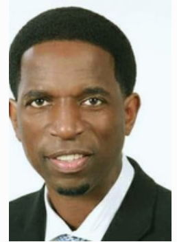
Keynote Speaker A.C. Green, L.A. LAKERS