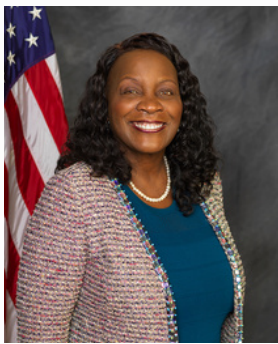
Lifetime Achievement Award Acquanetta Warren Mayor of Fontana