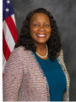
Keynote Speaker Acquanetta Warren Mayor City of Fontana